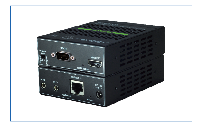
CR-uCAT5 HDMI 4KR