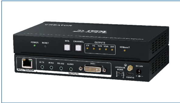
CR-uCAT5 COMP 300R