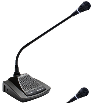
Tabletop discussion chairman unit CR-M4102B