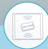
IC card sign in